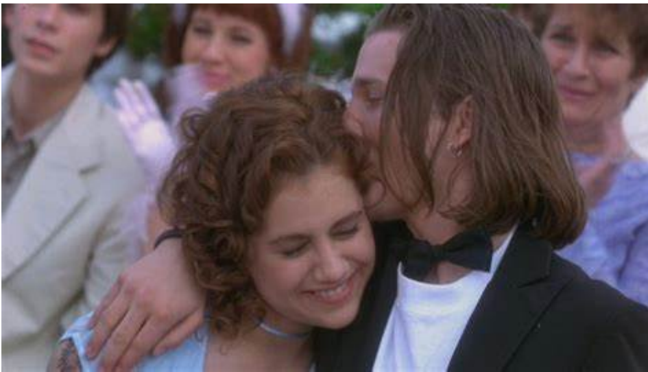
Tai and Travis were so cute, I'm so happy they ended up together!!