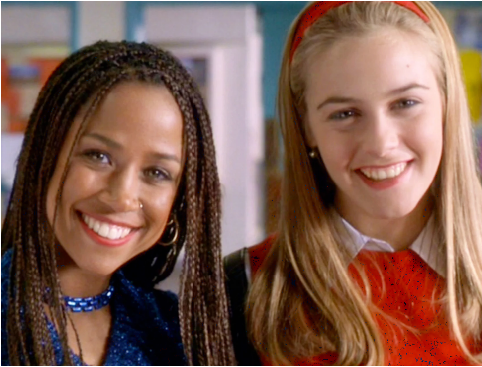
Cher and Dionne were so iconic, I loved their friendship!! <3