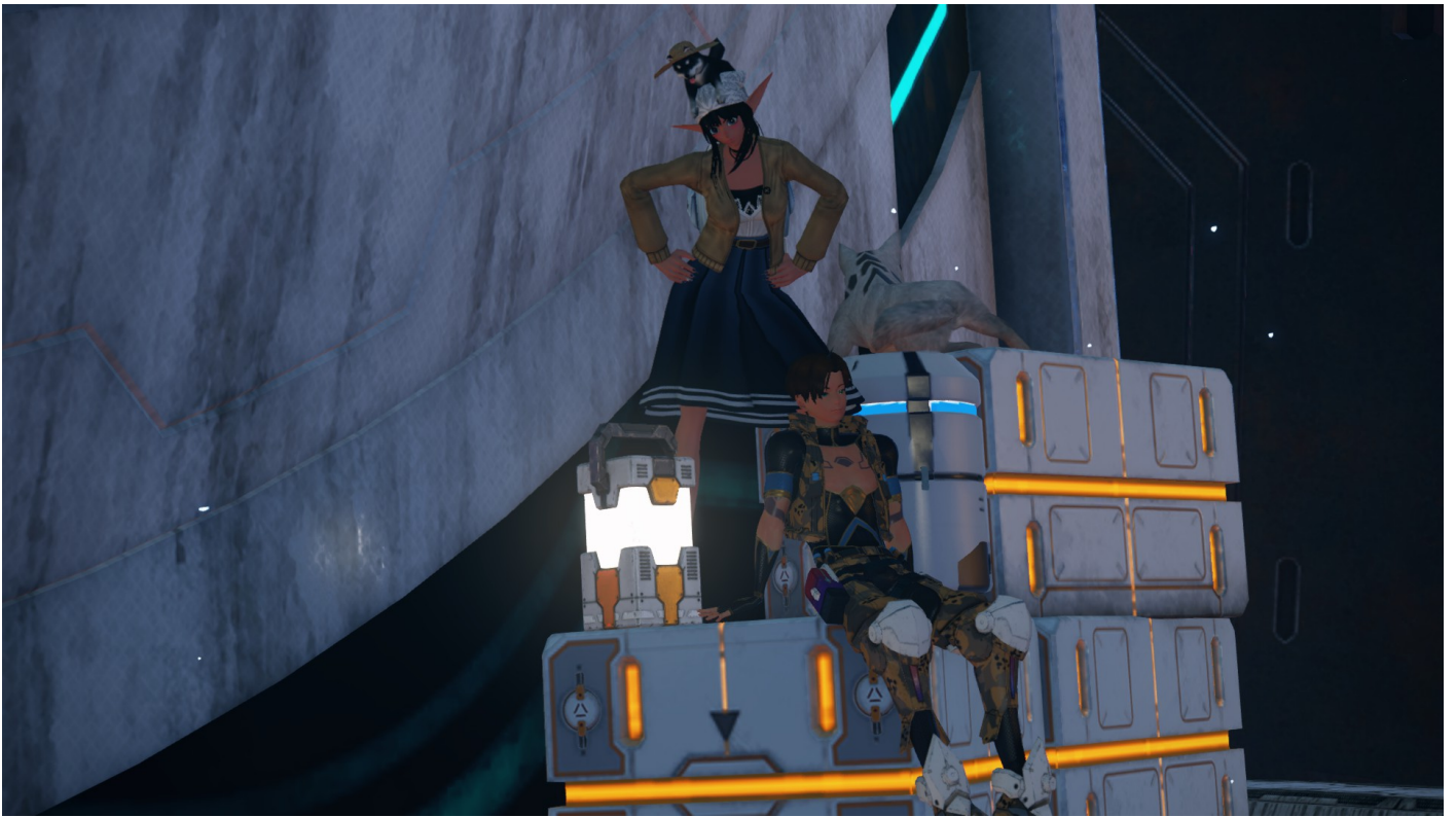
She found this cutie chilling! More importantly, he has a dog.