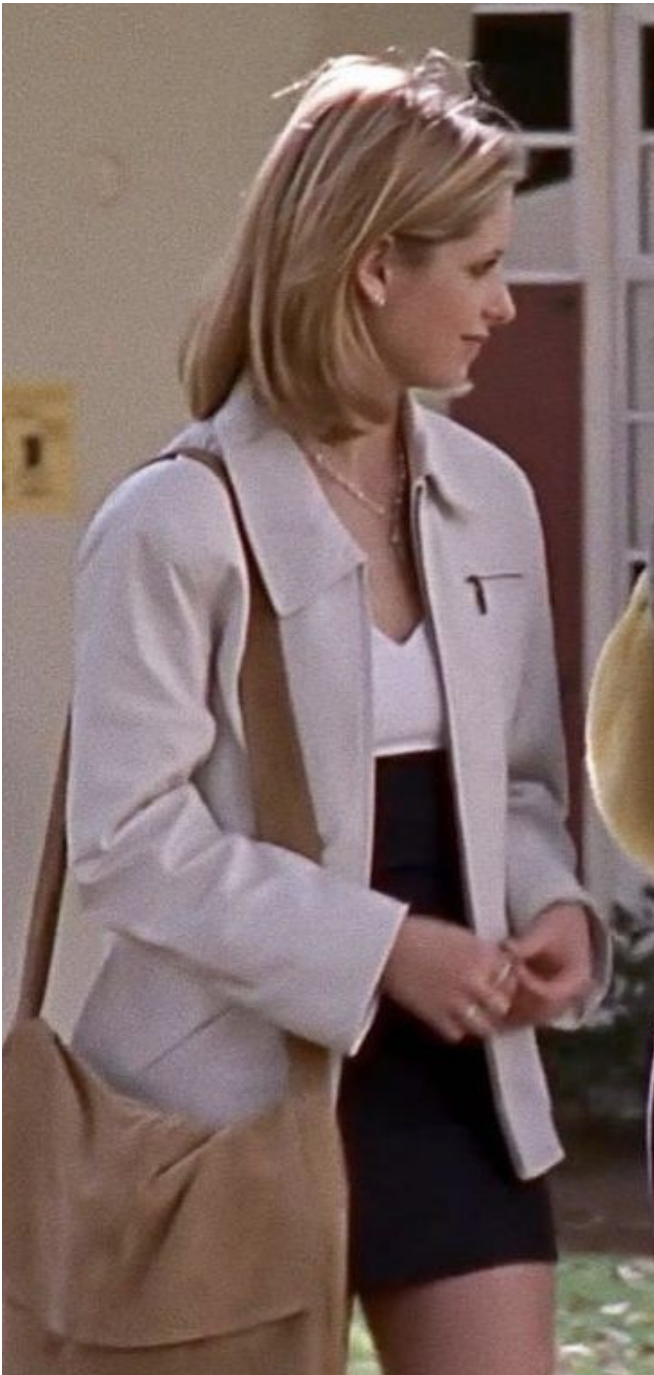
such a basic but chic outfit.