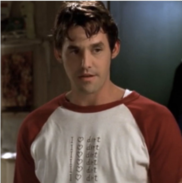
not a Buffy outfit, but I love Xander's I <3 dirt shirt, I would actually wear this