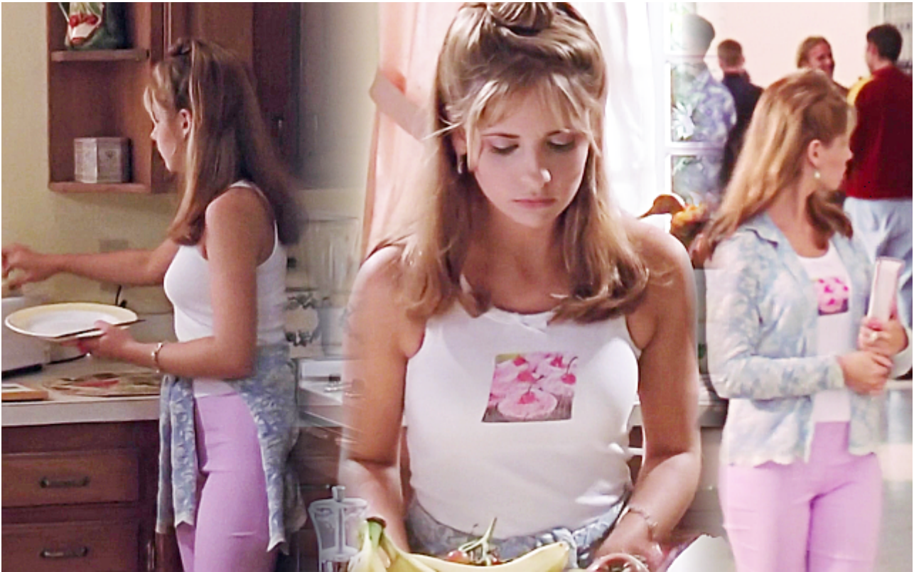
this cupcake shirt is so adorable, love the pastels in this outfit