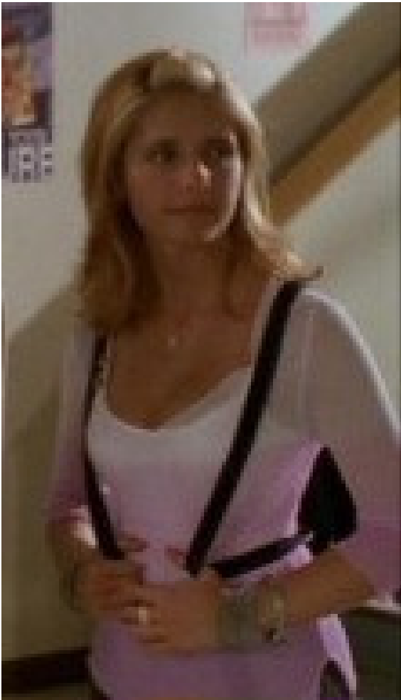
the pink and white ombre is so pretty